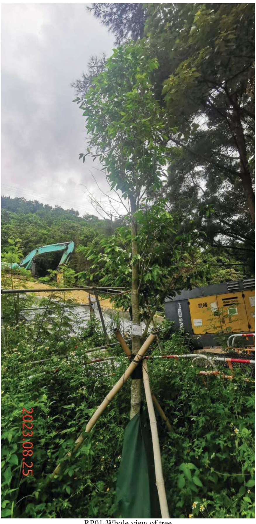
RP01-Whole view of tree

Tung Chung New Town Extension—Salt Water Supply System Monthly Monitoring Report for the 3 Nos. Replacement Planting Aquilaria sinensis (August 2023)