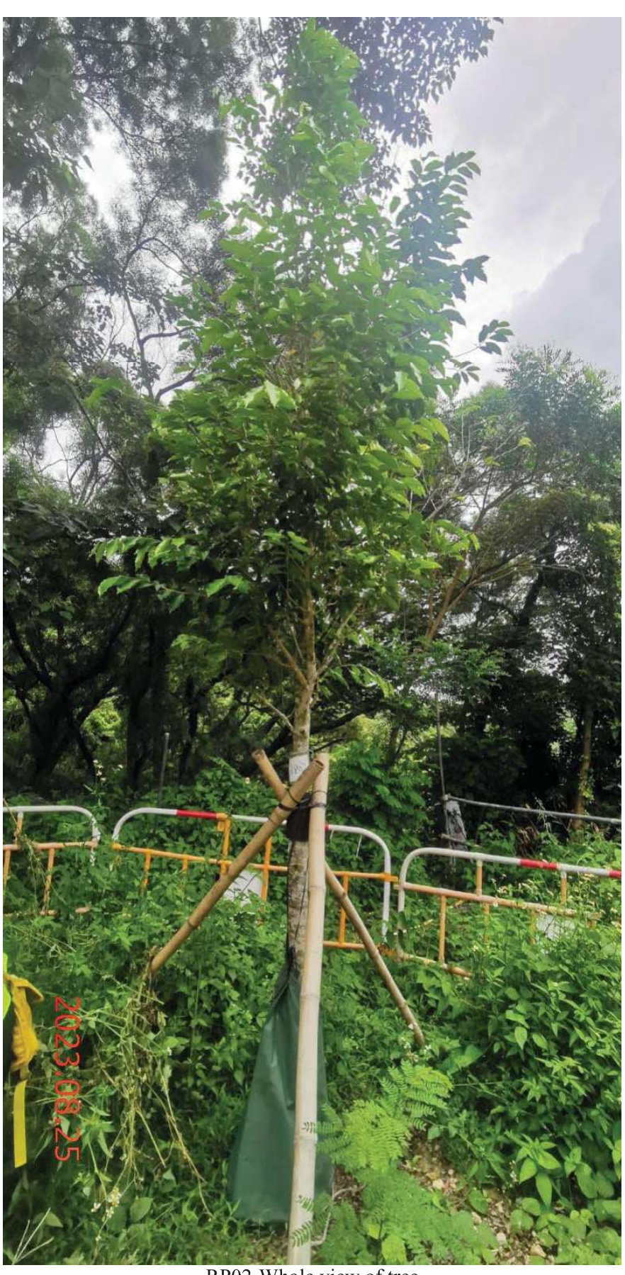
RP02-Whole view of tree

Tung Chung New Town Extension—Salt Water Supply System Monthly Monitoring Report for the 3 Nos. Replacement Planting Aquilaria sinensis (August 2023)