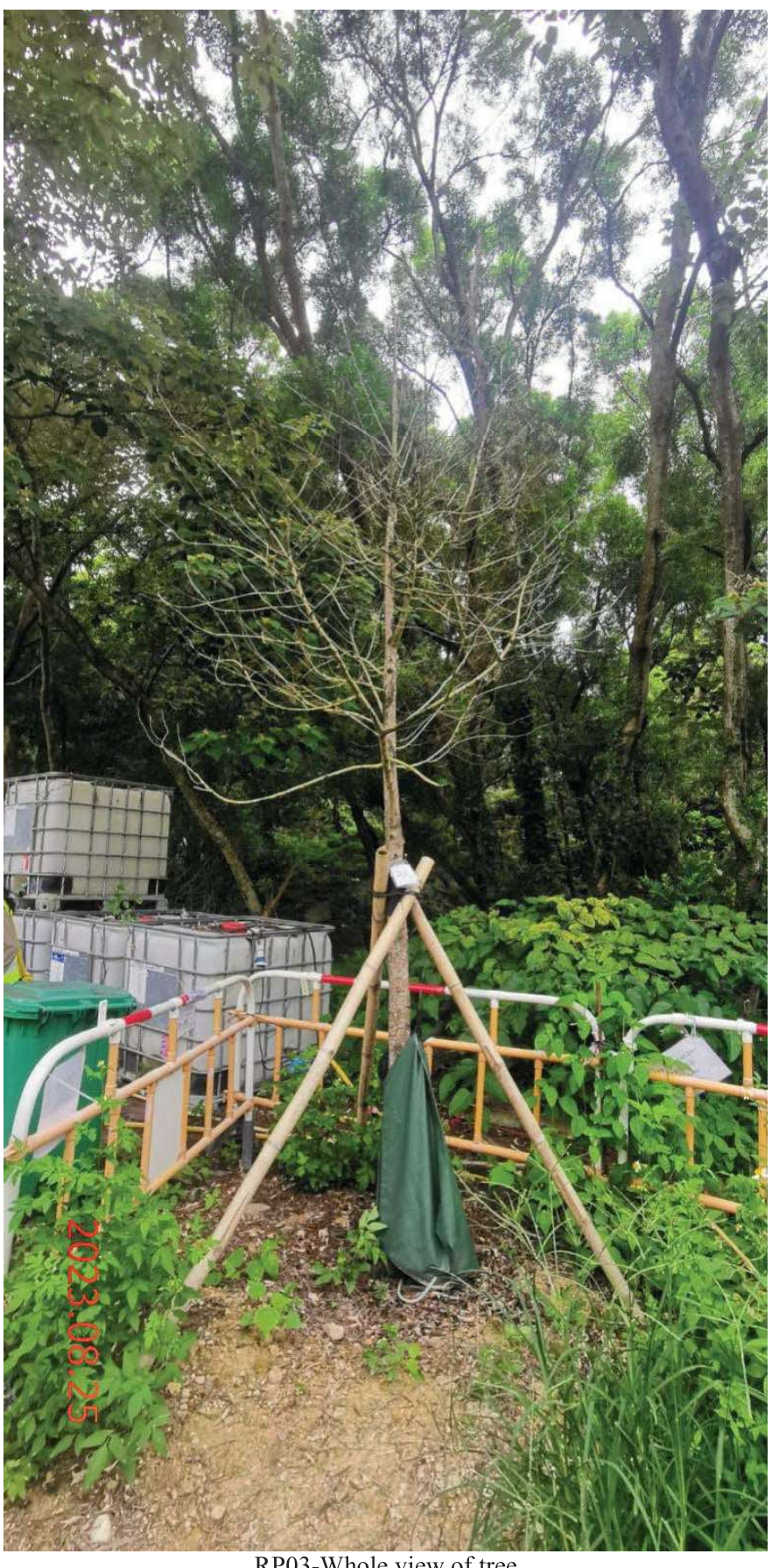
RP03-Whole view of tree

Tung Chung New Town Extension—Salt Water Supply System Monthly Monitoring Report for the 3 Nos. Replacement Planting Aquilaria sinensis (August 2023)